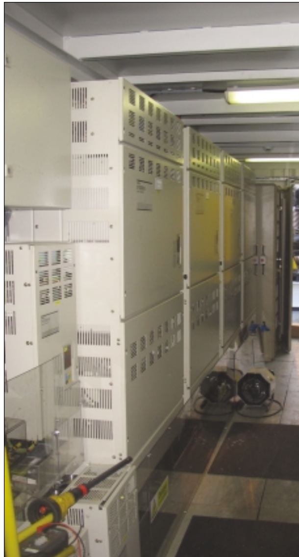
Surface module with 1.5MW of AC 6 pulse drives, sinus filters and 400V/3300V step up transformers.

The Lineator is a patented, multi-limbed reactor with a relatively small capacitor bank whose output, when connected to AC or DC drives, produces a trapezoidal voltage which forces the